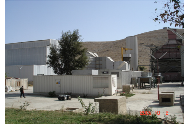
NW Kabul Unit 3