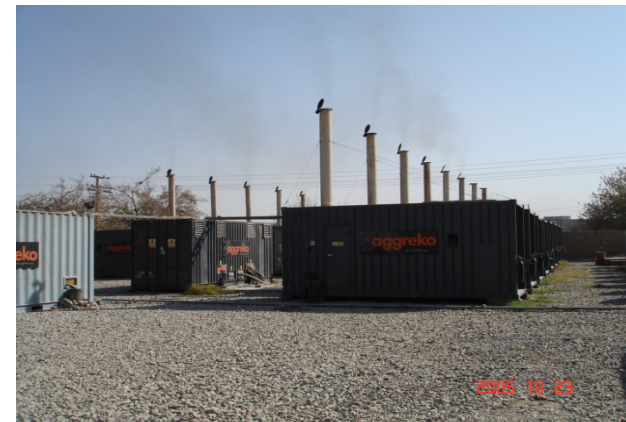
Kandahar Gen Sets